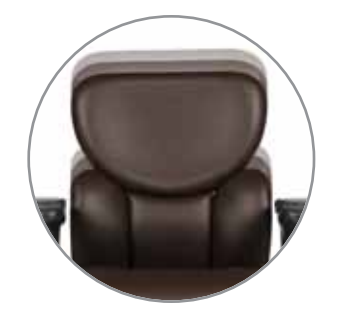
Back & Lumbar area are height adjustable on ratchet system. Position lumbar area for user comfort.